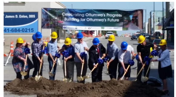
Ottumwa Mainstreet Groundbreaking 5/16/2019

The streetscape project will rehabilitate the 100-300 blocks of East Main Street in downtown Ottumwa. This is a full-depth, full-width reconstruction of the streets, sidewalks, and all utilities. As a qualifier for a Community Facilities CDBG ($800,000) and an urban water quality initiative grant from the Iowa Department of Agriculture and Land Stewardship ($55,000), the project will incorporate stormwater runoff and treatment features. This includes permeable pavers in the intersections and selected parking areas, as well as vegetated bioretention cells in the intersection bump-outs and mid-block crosswalk areas. This project is administered by Area 15 RPC and construction to begin in July and finish in late-2020.