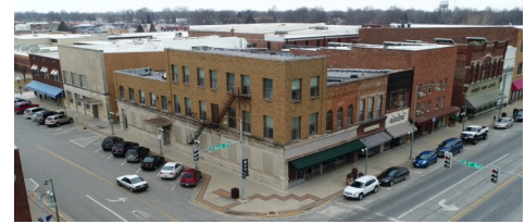
Oskaloosa before Rehabilitation Rendering of Improvements